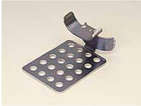
The Roof Clip Bracket Kits are for use with 12-watt heat cables. The roof clips are used to secure 12-watt heat cables to roofs and gutters. Available from HotEdge, LLC.